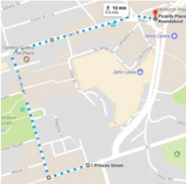
via St Andrew's Square and York Place